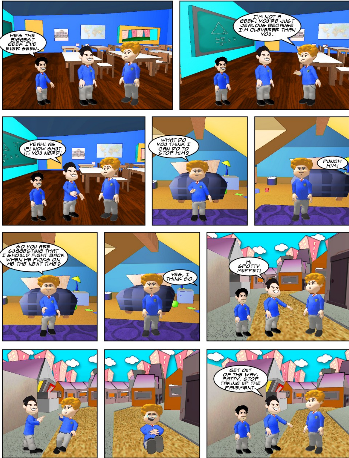
Figure 3. A segment from a comic strip created by our system depicting a story generated by FearNot!