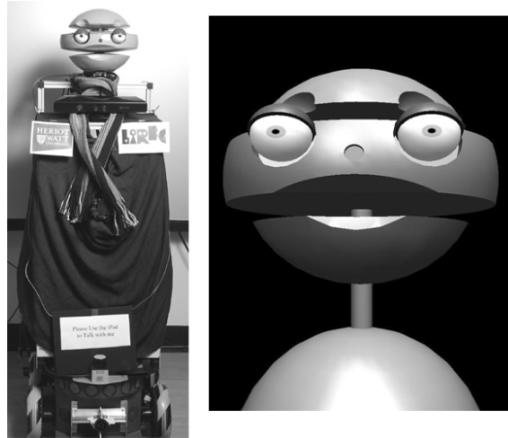
Fig. 2. The robot and virtual character embodiment of the Spirit Of the Building companion showcase, that the example scenario is derived from

they expect a visitor but are uncertain of his time of arrival they ask their companion to migrate to the screen installed at the building entrance and to wait there for the visitor and greet him. This scenario could continue with the agent migrating to the visitor's phone to guiding him to his destination and then finally migrating back into the robot embodiment. We will only focus on the first migration here.