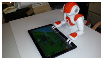
Figure 2: Nao with tablet

The robot tutor is equipped with a game-specific AI player that allows it to play any of the three roles in the game. This kind of AI can rank actions by their individual or global return and so can either select the action that produces the biggest gain for its role or the action that maximises global score. Using the same information, it can also evaluate the actions of other players. This allows it to make contextual tutorial comments on the relation between individual and global gain.