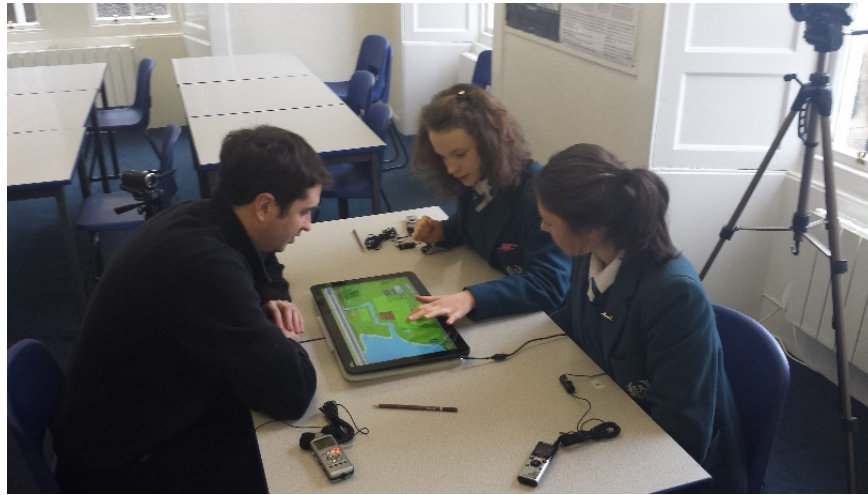
Fig. 4. Teacher playing Energities with 2 students