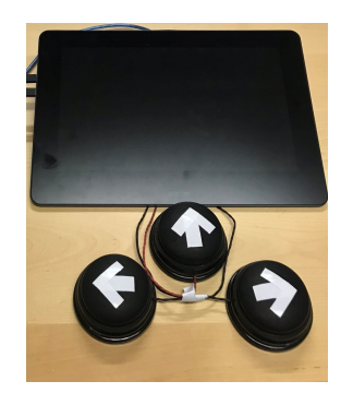
Figure 5: Control Buttons and the screen to present the video feed

The Basic Guiding Game includes a core cognitive load: taking someone else's perspective. For this game (Figure 1), we design a simple backstory for the child to guide the robot from start to finish point, while we simultaneously evaluate children's performance in taking the robot's perspective. The game scenario is as follows: Cozmo needs to collect stars in order to survive in a field. To collect the stars the robot needs to take risks and get out of the safe zone (represented by green) and move along the grey roads. If the robot goes to the red nodes within the danger zone (represented by black), it loses the game. We computed the position of the roads and the nodes to serve the perspective-taking goal of the game, which we will describe in detail in the following sections.