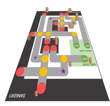
Figure 6: The sample map of Basic Guiding Game including the wooden blocks.