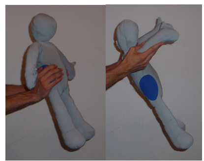
Figure 1. First prototype of SenToy

To "influence" the character players use SenToy, a wireless tangible interface with sensors in its body that allows the user to control the emotions of the character. The user must express appropriate gestures with the doll representing one of the following six emotions: anger, fear, surprise, gloat, sadness and happiness. SenToy is equipped with three sets of sensors: the accelerometers, which measure the acceleration that the SenToy is subjected to; analogical sensors, used to determine the limbs position; and digital sensors, used to indicate whether the hands of the doll are placed over the eyes or not. Since the emotions cannot be obtained directly from the rather complex data received from the SenToy sensors, a signal processing module was required and implemented so that the adequate patterns of movement can be detected.