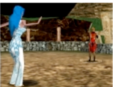
Figure 3. A Duel