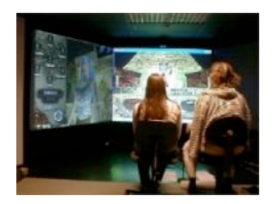
Figure 4. One session of FantasyA's evaluation

Latter, after the first experience and when the recognized gestures were explained, all the subjects could easily manipulate the SenToy. We concluded that SenToy can be a good interface to express emotions but it would be improved if alternative gestures for some of the emotions were provided.