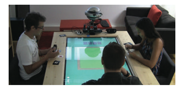
Figure 2: Example of a card game session with EMYS.

sidering the theoretical complexity of the construct.