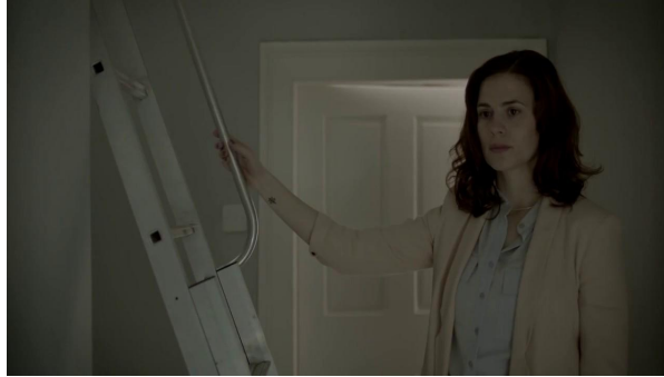
Maladaptive social functioning for the daughter